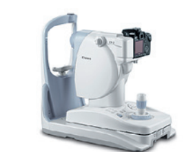
CR-2 Digital Non-Mydriatic Retinal Camera

The industry's lightest wireless detector, weighing only 7.5 lbs., offers a high level of flexibility, increased workflow efficiency and ease of use, all with a low dose to patients.